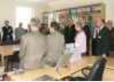
Opening the Library 2006

As the Archive plans for the long term, monthly standing orders are vital to ensure that regular costs are covered by regular income. So to qualify for full membership, we ask you to complete and return the standing order form opposite. Single donations are also very welcome, and in return for a donation of £25 we will send you three free copies of Mill Memories .