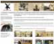
The Friends' Website